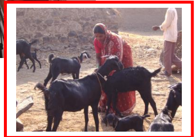
MWGIGA – Goat Rearing