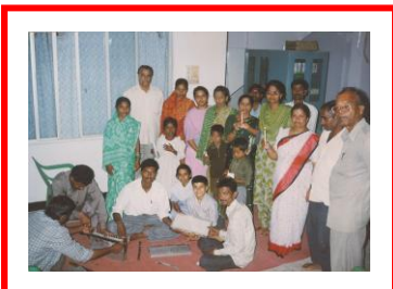
Candle, Envelop Making