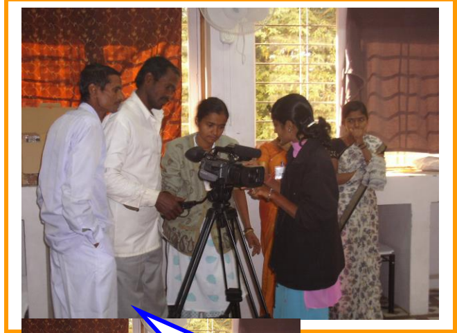
UNDP – Video Doc. Trg. For PLHIV