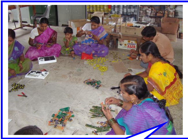
MWGIGA - Electronic Assembly Unit