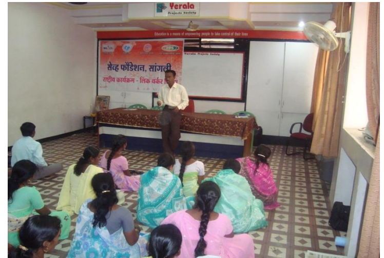
SHG Capacity Building Trainings