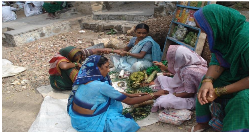
Income Generating Activity