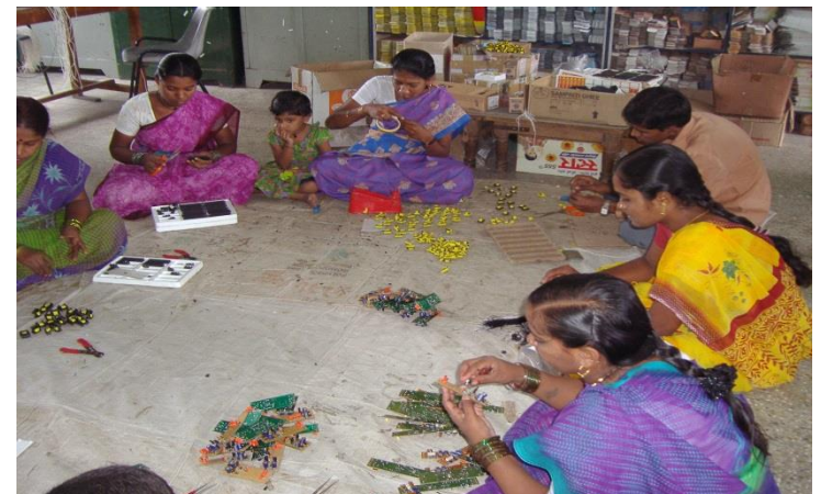
Income Generating Activity