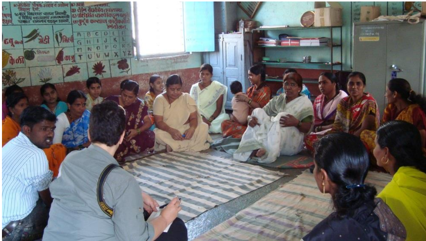
SHG Formation and Meetings